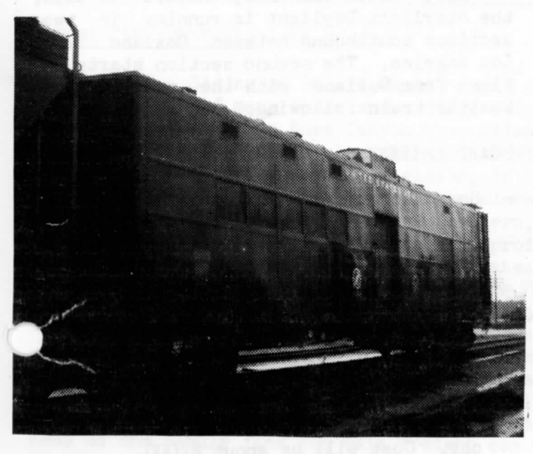
EMERGENCY FUND DRIVE - NEW ROSTER OF MEMBERS - TROOP KITCHEN CAR

This issue includes a brochure for an emergency fund drive - a drive which, if successful, will bring to PSRMA and the Bicentennial Celebration a full size operating steam locomotive. The task is awesome but the reward is out-of-this-world.